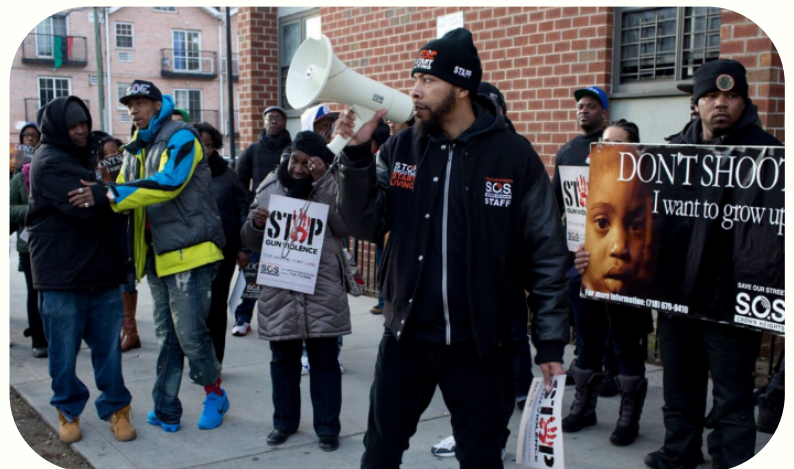
Aim4Peace engages community members about ways to decrease violence in their neighborhoods.

*Priority neighborhoods are defined as a priority area of East Patrol that specifically experience higher rates of violence.