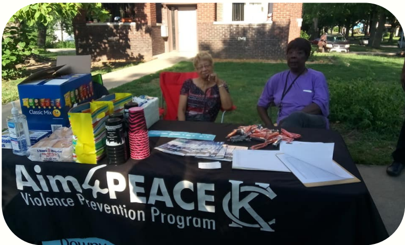
Outreach with the Santa Fe Neighborhood Association.

Neighborhood canvass or anti-violence activities.